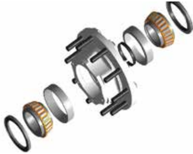
Unitized Wheel End