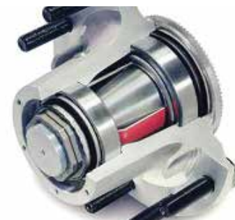
Pre-Adjusted Wheel End