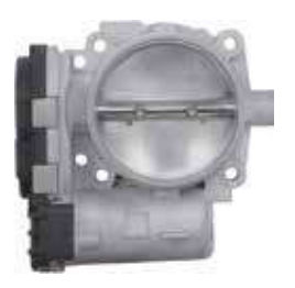
67-5006 - Available Only at CARDONE! 2013-15 Mercedes E350 V6 3.5L