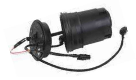
5D-9011L - High Demand! 2012-14 Volkswagen Passat