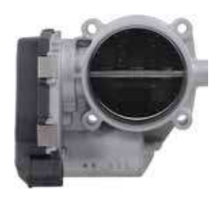
67-4012 - Available Only at CARDONE! 2010-16 Audi S5/S4 V6 3.0L

Best coverage, best prices, exclusive application offerings!