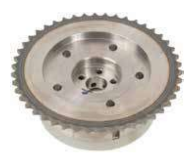
7V-1005P - High Demand! 2006-17 Chevrolet/GMC