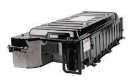
5H-4002 - High Demand! 2004-09 Toyota Prius GEN 2