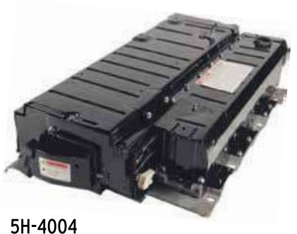
2007-11 Toyota Camry