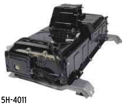
2012-15 Toyota Camry, Lexus ES300H