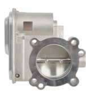
6E-7002 - High Demand! 2007-17 Jeep Trucks; Dodge/Chrysler 2.4 L Vehicles