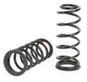
4J-6001K 2003-09 Toyota/Lexus Trucks – Rear