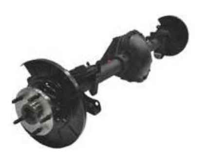
3A-17006MSJ - New Offering! 2001-04 Jeep Grand Cherokee