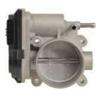
6E-0012 - High Demand! 2004-10 Infiniti Trucks; 2004-17 Nissan Trucks