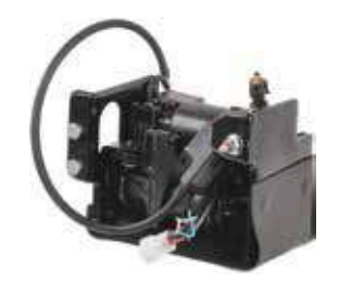
4J-0003C - High Demand! 2000-17 GM Trucks

A comfortable ride for years to come – at a fraction of the typical market price.