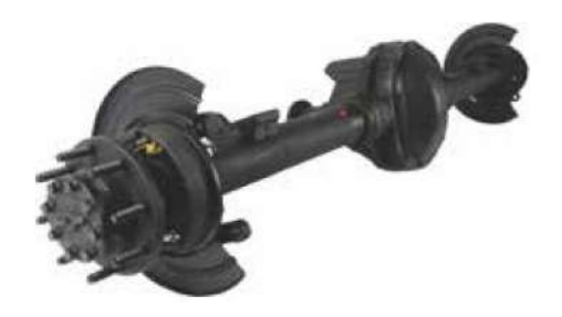
3A-2000LSJ - Available Only at CARDONE!

2002-07 Dodge Ram 1500 Pickup 4WD and w/ Limited Slip Differential and w/ 3.92 Axle Ratio