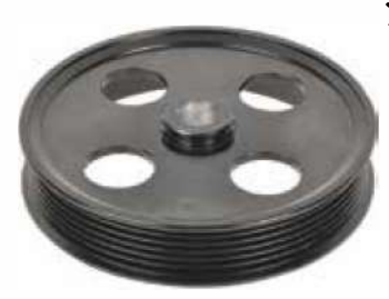
3P-35133 - High Demand 2001-07 Chrysler, Dodge