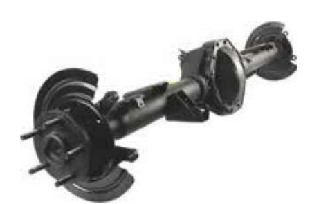
3A-17000LSW - High Demand!

2002-07 Dodge Ram 1500 Pickup 4WD and w/ Limited Slip Differential and w/ 3.92 Axle Ratio