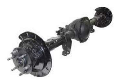
3A-18000LOC - High Demand! Available Only at CARDONE!

1999-2004 Chevrolet Silverado 1500, GMC Sierra RWD and w/o Limited Slip Differential and w/ 3.08 Axle Ratio