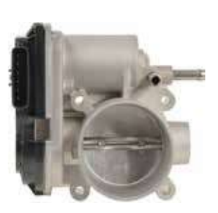
6E-0014 - High Demand! 2007-17 Nissan Vehicles