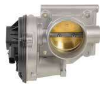
6E-6008 - High Demand! 2005-07 Ford/Mercury Vehicles