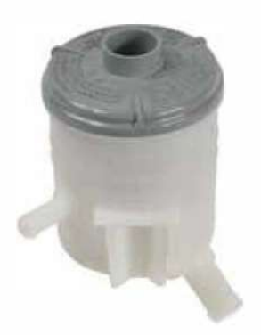
3R-216 - High Demand 2001-05 Acura. Honda

O.E. design match, including reservoir cap