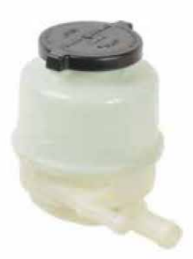
3R-102 - High Demand 2002-12 Lexus, Toyota