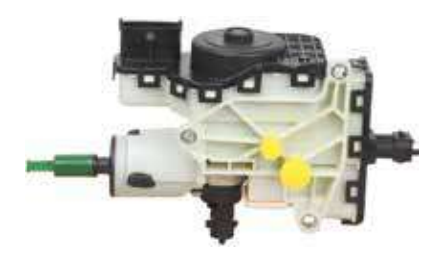
5D-1000 - High Demand! 2010-16 Chevrolet/GMC 6.6L Trucks

Plug-and-play design makes installation a snap!