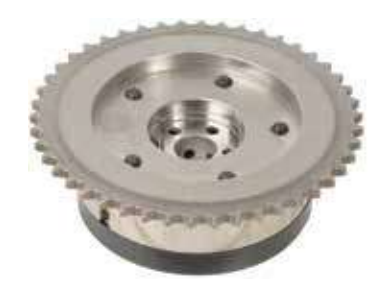
7V-1000P - High Demand! 2006-17 Chevrolet/GMC