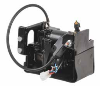
4J-0003C 2000-06 CHEVROELT SUBURBAN, TAHOE, AVALANCHE/GMC YUKON

A comfortable ride for years to come at — at a fraction of the typical market price.