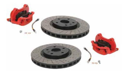
2B-9020XR 2010-13 CHEVY CAMARO, CAPRICE FRONT, RIGHT & LEFT

New cross-drilled & slotted rotors New stainless steel braided brake lines New semi-metallic upgraded brake pads Reman red powder-coated calipers