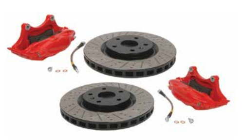
2B-9040XR 2008-14 SUBARU IMPREZA, 2015 SUBURU WRX STI FRONT, RIGHT & LEFT