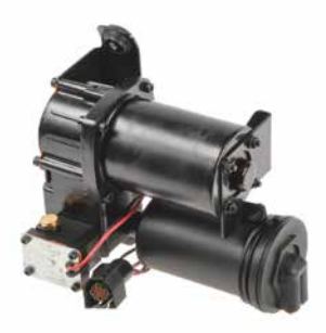
4J-1000C 2007-14 FORD EXPEDITION