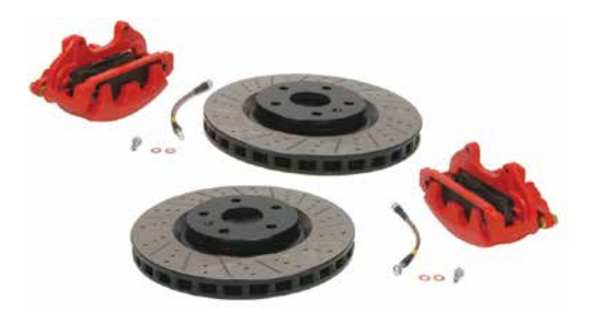
2B-9010XR 2005-11 DODGE CHARGER, 300 FRONT, RIGHT & LEFT