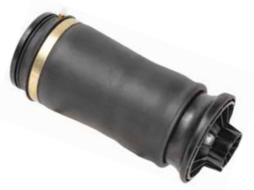
4J-2001A 2007-12 MERCEDES GL350/GL450/GL550