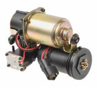
4J-1001C 1984-92 FORD LINCOLN MARK VII