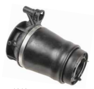
4J-1012A 2003-06 FORD EXPEDITION/ LINCOLN NAVIGATOR

4J-1007A 1998-2005 FORD CROWN VICTORIA/ LINCOLN TOWN CAR/MERCURY GRAND MARQUIS