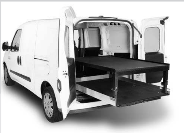
Stationary Double Deck