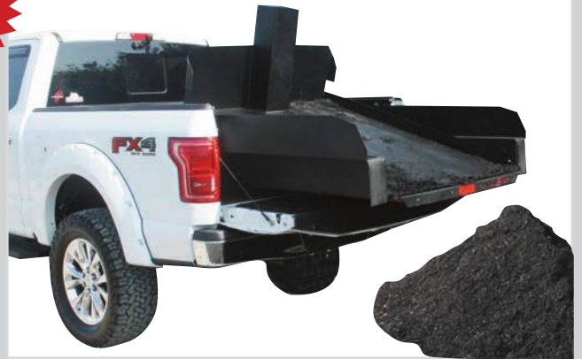
Aluminum Dump Box Insert