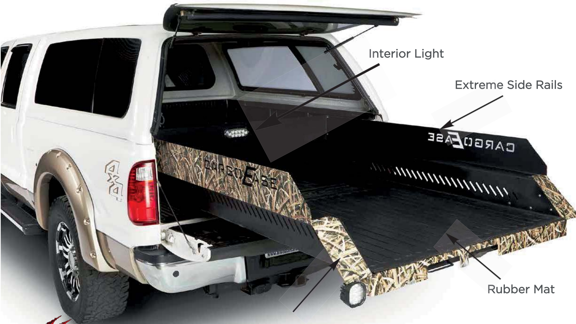
4 Camouflage Side Rail options