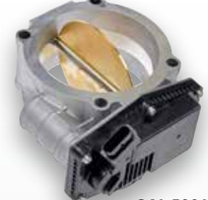
341-5001 Detroit Diesel Series 60, 16, 15, 13 Engines 2015-87

904-310 Sprinter, Freightliner, Jeep, Mercedes 3.0L Diesel 2015-05