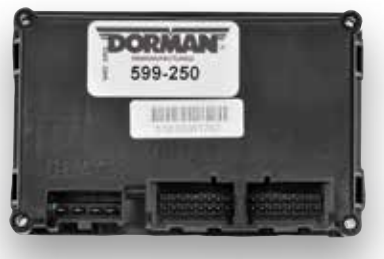
NEW 599-250 Buick Rainier 2007-06, Chevrolet Trailblazer 2009-06, GMC Envoy 2009-06