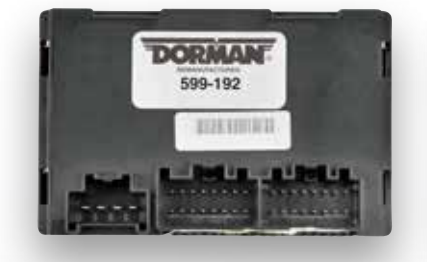
NEW 599-192 Chevrolet Silverado/Tahoe 2013-07, GMC Sierra, Yukon 2014-07 with RPO Code NQH