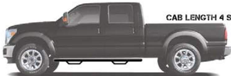
CAB LENGTH 4 STEP