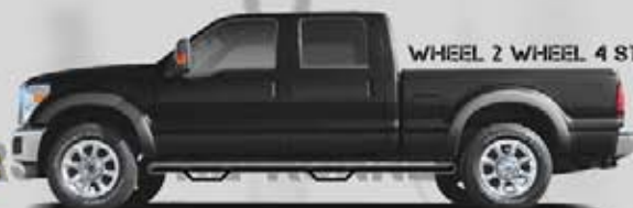
WHEEL 2 WHEEL 4 STEP