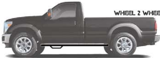
WHEEL 2 WHEEL 2 STEP