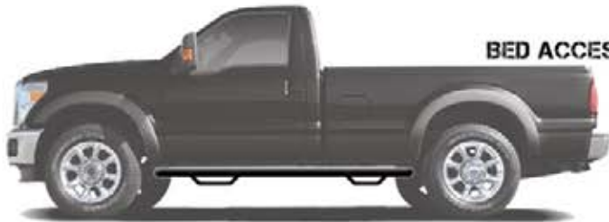
BED ACCESS 4 STEP