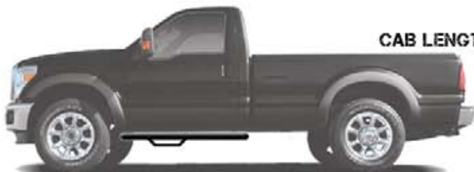
CAB LENGTH 2 STEP