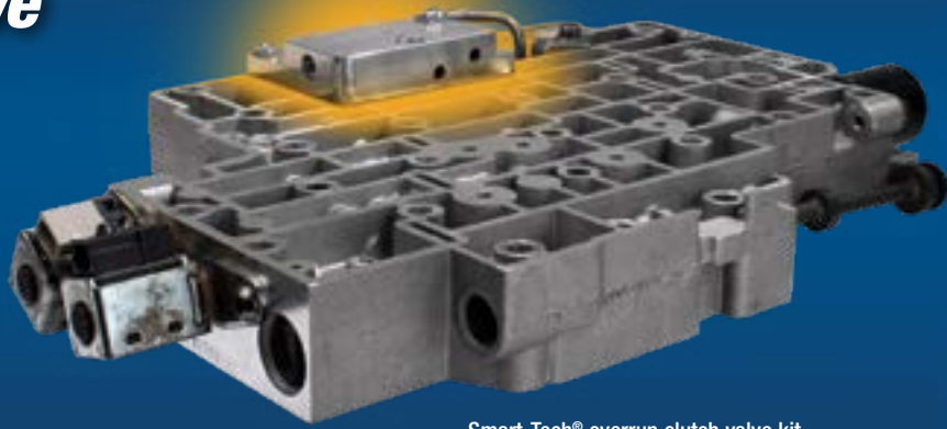
Smart-Tech® overrun clutch valve kit (Part No. 34200-40K ) also available separately.