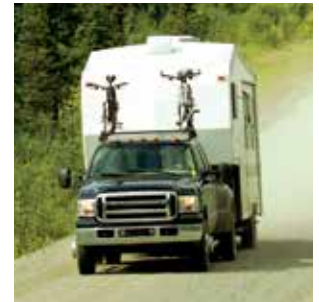
Truck Towing and Trailers