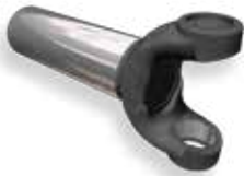
J300P SECTION 3 Slip Yokes (Part Type Number Set = 3) Splined Sleeves (Part Type Number Set = 55)