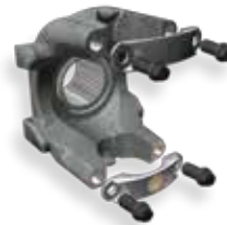
J300P SECTION 4 End Yokes (Part Type Number Set = 4)