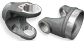
J300P SECTION 5 Tube Yokes (Part Type Number Set = 26 or 28) Center Yokes & Center Plates (Part Type Number Set = 26)