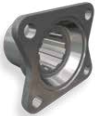
J300P SECTION 1 Companion Flanges (Part Type Number Set = 1)