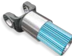
J300P SECTION 8 Yoke Shafts (Part Type Number Set = 82)