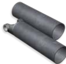
J300P SECTION 6 Tubing (Part Type Number Set = 30 or 32) Yoke & Tube Assemblies (Part Type Number Set = 27)