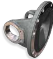
J300P SECTION 2 Flange Yokes (Part Type Number Set = 2)