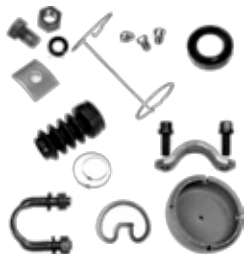
J300P SECTION 9 Miscellaneous Parts • bolts • nuts • dust caps • balance weights • keys • tube deadeners • snap rings

OLD STYLE: Identify the part by the 2nd (center) number set (as shown on the previous page) of the complete part number. In the complete part number, with the exception of Journal & Bearing Kits, Support Bearing Assemblies, Driveshaft Assemblies, and Tubing, the: