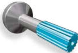
J300P SECTION 7 Tube Shafts (Part Type Number Set = 40 or 42) Midship Tube Shafts (Part Type Number Set = 53 or 54)