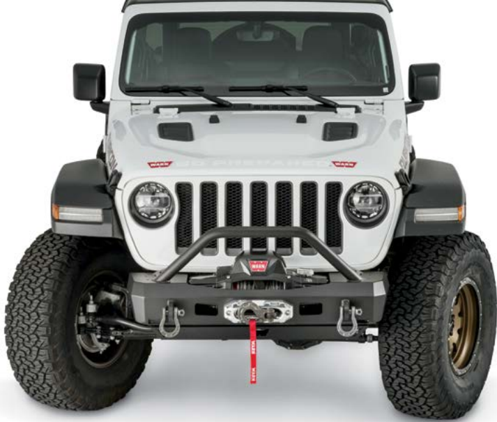
101330 Elite Series Stubby Front Bumper With Grille Guard Tube