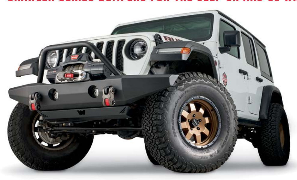
102146 JL & JK Full-Width Crawler Bumper With Grille Guard Tube