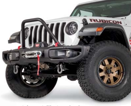
102346 Stinger Grille Guard Tube