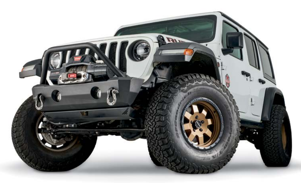
102510 JL & JK Stubby Crawler Bumper Without Grille Guard Tube