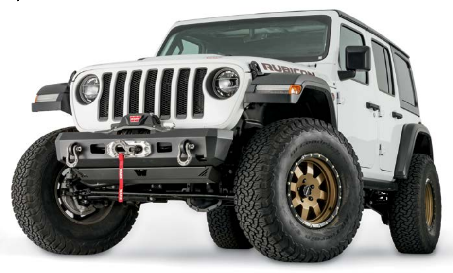
101325 Elite Series Stubby Front Bumper Without Grille Guard Tube Shown above with optional skid plate, compatible with all Elite Series JL Front Bumpers, 101445