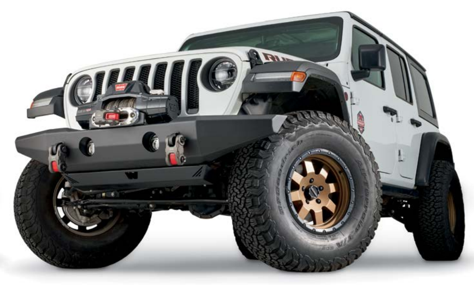
102145 JL & JK Full-Width Crawler Bumper Without Grille Guard Tube