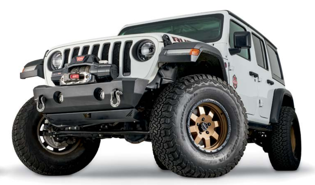
102520 JL & JK Stubby Crawler Bumper With Grille Guard Tube 101565 Skid Plate for Jeep JK Wrangler Crawler Series Front Bumpers 101445 Skid Plate for Jeep JL Wrangler Crawler Series Front Bumpers