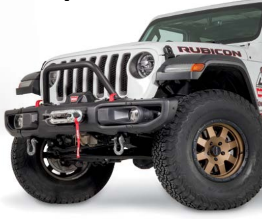
102350 Mid Grille Guard Tube