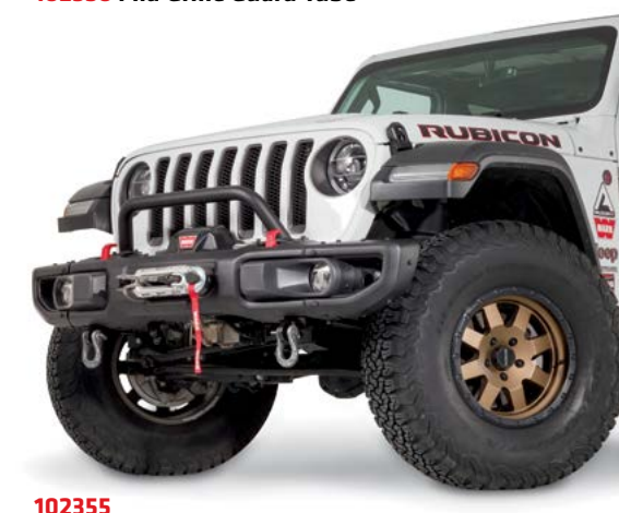
Low Grille Guard Tube