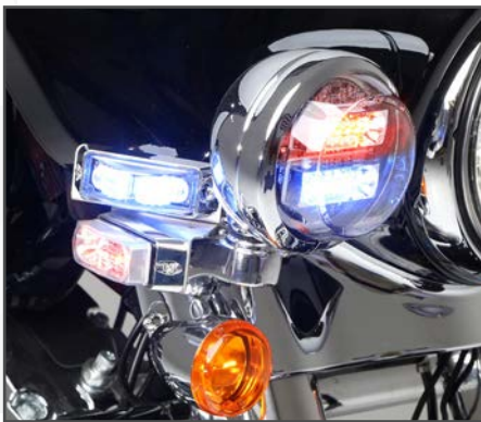
Front passing/fog lamp kit available in 90° or 90° and 45° models. Includes flange