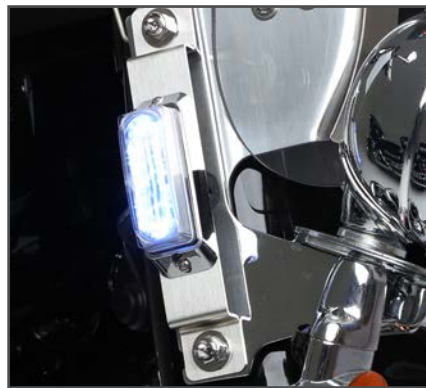
Side Fork Mounting Bracket Kit allows for easy mounting of one lighthouse. Includes flange