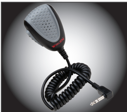
Noise Canceling Microphone