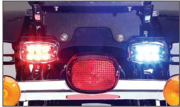
License Plate Bracket for horizontal mount of two lightheads M2KTHD1