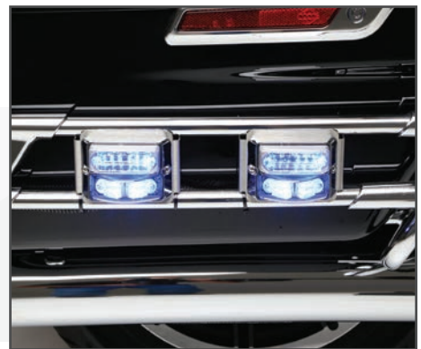
Side Mount Bracket for use with Harley-Davidson® OEM Saddlebag Wraps allow for easy mounting of two lighthouses. Includes flange