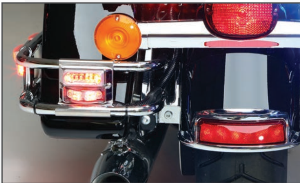
Rear (Harley-Davidson OEM Saddlebag) Crash Bar Mounting Kit allows for easy mounting of two lightheads. Includes flange RBKTHD9