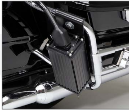
100 Watt Waterproof Siren Amplifier and Siren Mounting Bracket Kit