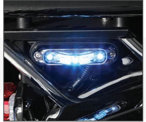
Surface Mount ION™ Under Radio Box Mount Kit for use with one lighthouse. Available in road side or curb side