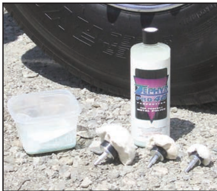
You will need an open container to hold a small amount of Zephyr Pro-40 Metal Polish. Also shown here are the 2", 3", and 4" Round End Shank-Mounted Goblet Buffs.