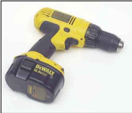
VARIABLE SPEED Cordless Drill/Driver