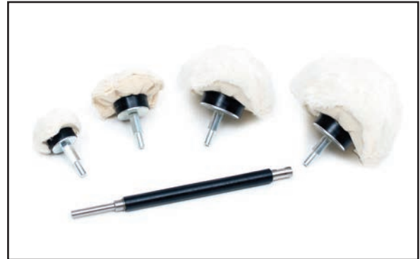
2" Round End Shank-Mounted Goblet Buff 3" Round End Shank-Mounted Goblet Buff 4" Round End Shank-Mounted Goblet Buff 5" Round End Shank-Mounted Goblet Buff 8" Extender for Shank-Mounted Buffs